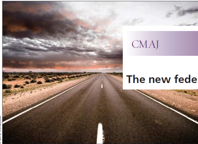
Among the major challenges faced by the Australian health system is delivering care in remote and indigenous communities where care is often scant.

The agreement features a host of new financial and governance arrangements